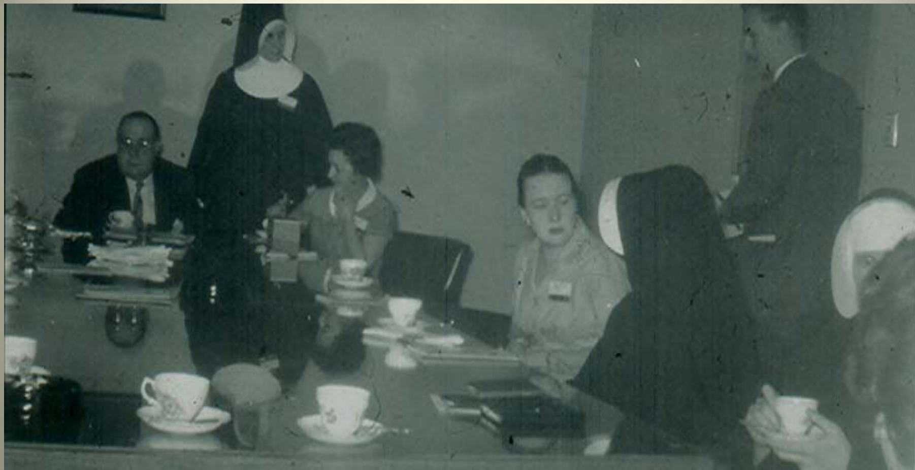
Branch Meeting St. Elizabeth's Hospital North Sydney, Nova Scotia