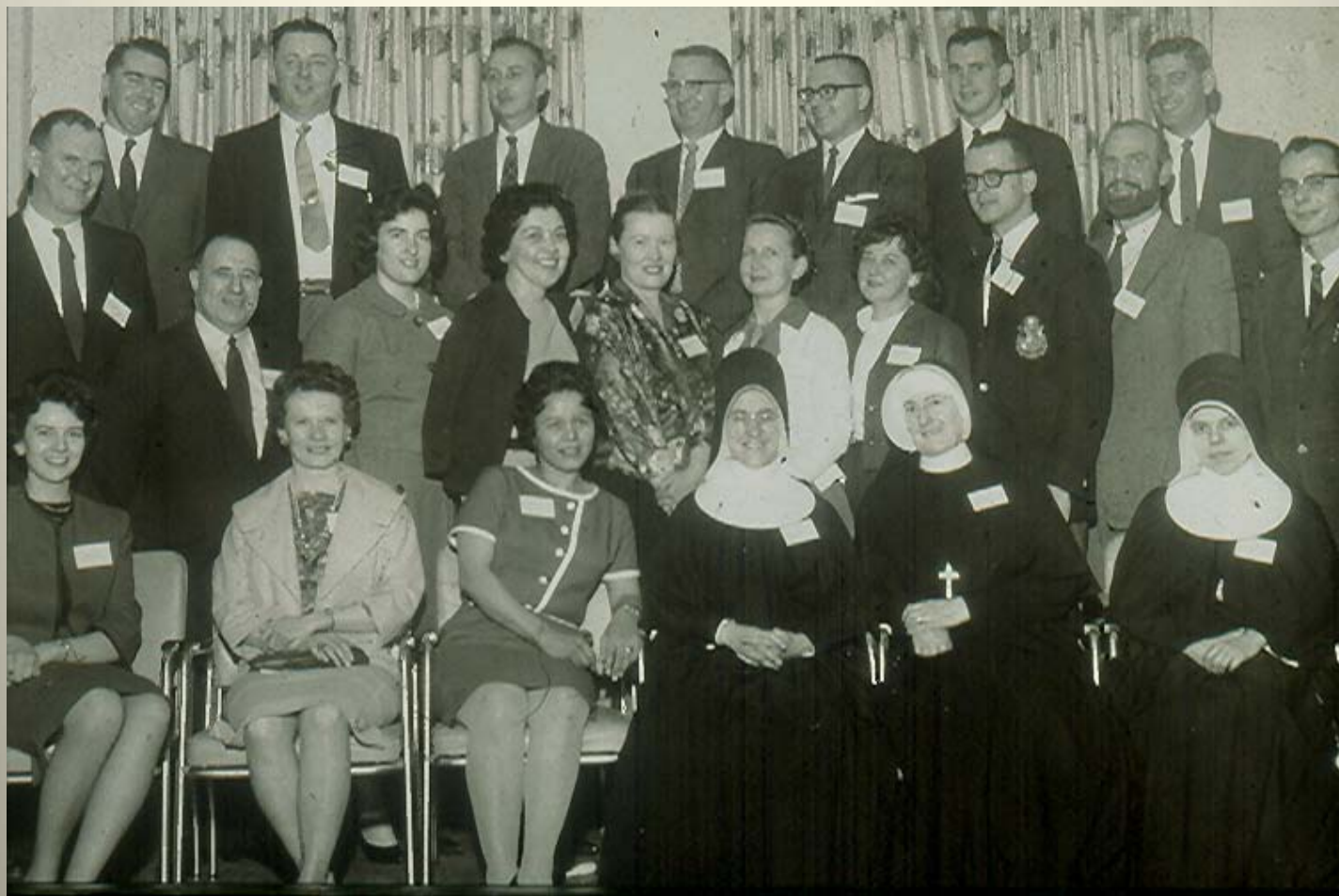
1963 Branch Institute Camp Hill Hospital